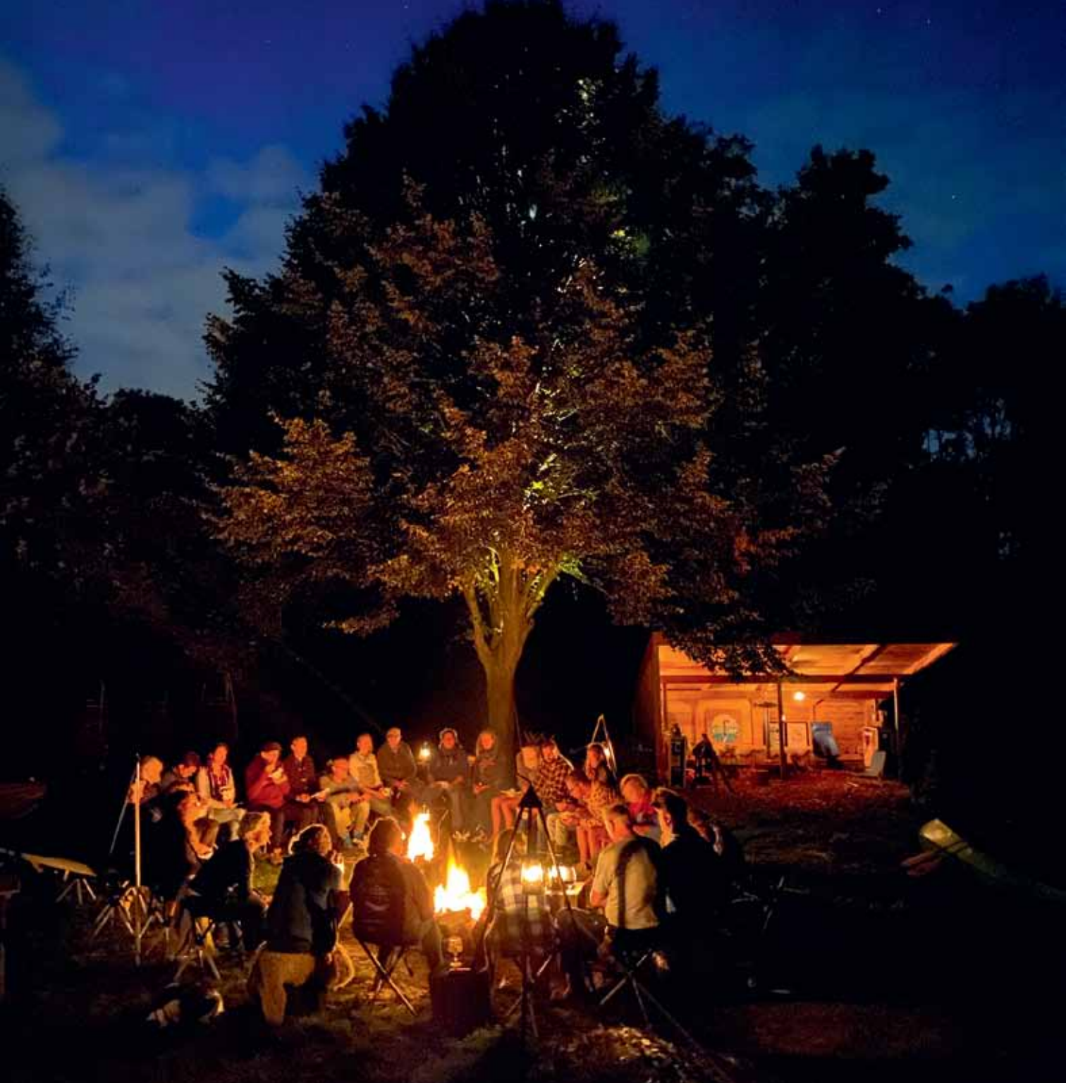
Stijn van Oss